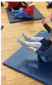
And our daily yoga!