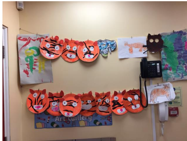
Our art gallery!