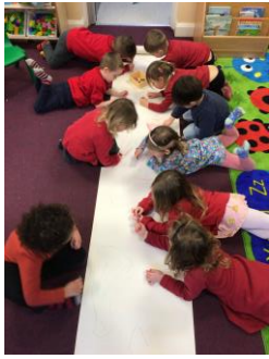
Large scale visualisation drawing after an audio story.