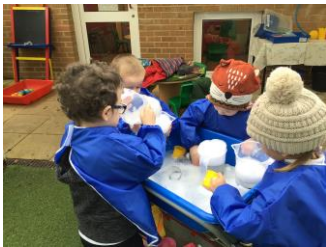
Exploring warm bubbly water with jugs and cups...lots of discussion and vocabulary.