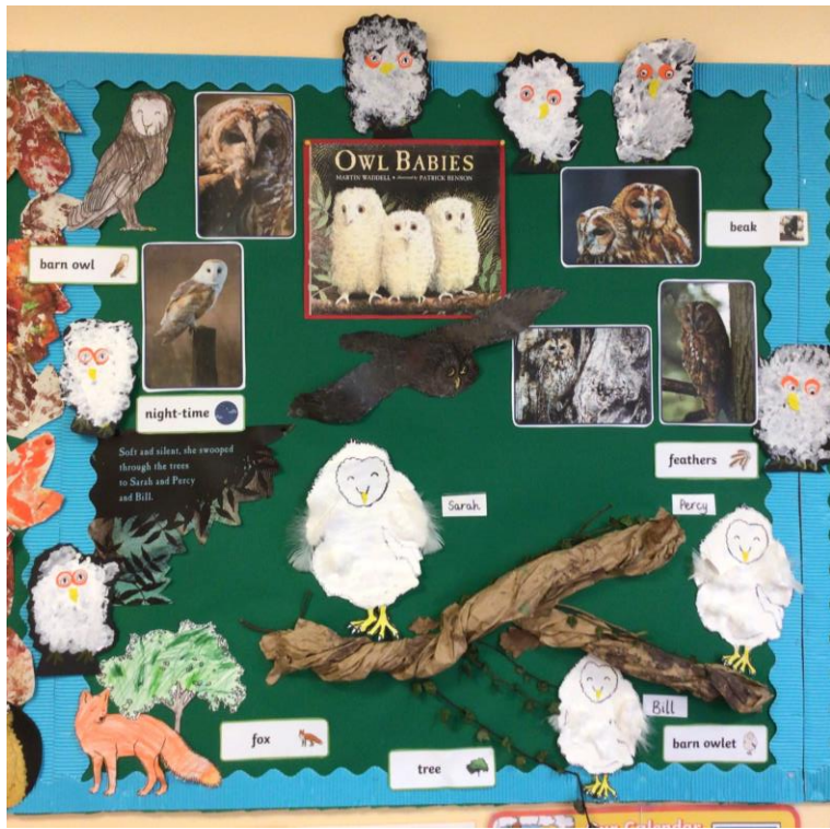
Some of the activities the children have benefitted from this term...