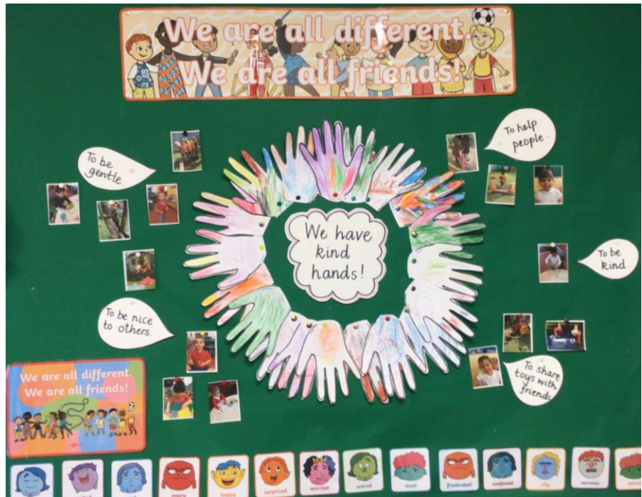
We talk about kindness and acceptance of each other.