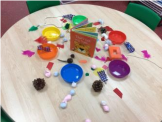
Tactile table-lots of vocabulary to describe how things feel.